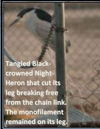
Tangled Black-crowned Night-Heron that cut its leg breaking free from the chain link. The monofilament remained on its leg.