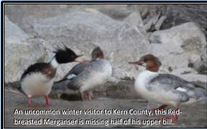
An uncommon winter visitor to Kern County, this Red-breasted Merganser is missing half of his upper bill.