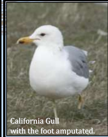
California Gull with the foot amputated.